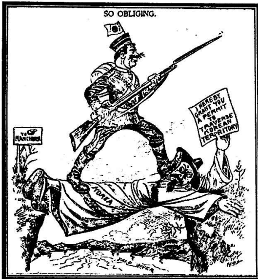
Political cartoon of the Russo-Japanese War. "So Obliging", Source: Brooklyn Eagle, February 17 th , 1904

In the late nineteenth century, there was a general race for colonies among the major imperial powers as each nation tried to carve out spheres of influence for trade and pursued colonial ambitions. Korea was caught in the conflict among China, Russia, and Japan as each sought to make it a colony. Other powers, like Britain, France, and the United States also were involved. Korea, which was just emerging from its self-imposed isolation, faced the rival ambitions of these countries.